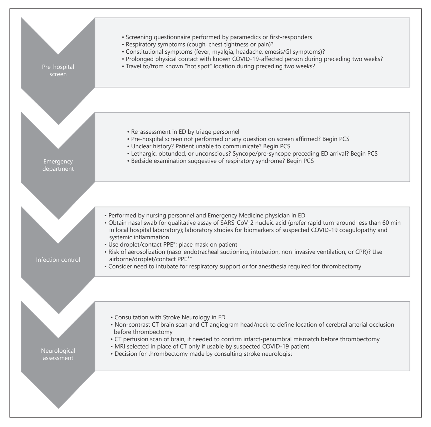
Fig. 1. Pathway identifying suspected COVID-19 patients for thrombectomy to treat stroke caused by LVO: note that assessment begins in the prehospital setting and continues into the Emergency Department, culminating with consultation provided by Stroke Neurology. LVO, large vessel occlusion; PPE, personal protective

equipment; PAPR, powered air-purifying respirator; PCS, protected code stroke (see Khosravani et al. [30]); *droplet/contact PPE (fully sleeved gown, face mask, eye protection, and gloves); **airborne/droplet/contact PPE (droplet/contact PPE with use of N95 mask and face shield or PAPR device).