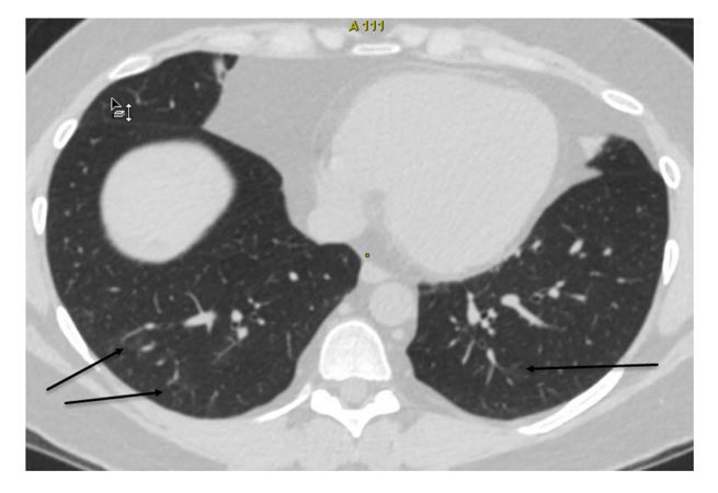
Fig. 2 Patient 2 computed tomography (CT) of the lungs 1 month after COVID-19 recovery. Resolution of consolidation with minimal residual ground-glass opacities (arrows)

In April 2020 the patient was hospitalized, tested positive for SARS-CoV-2 with dyspnea, cough, chest pain, and